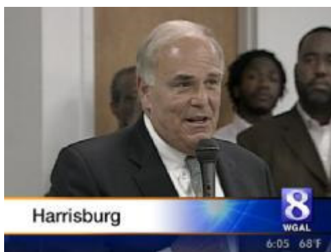
Rendell offered state resources to help quiet the streets, including the use of state troopers to patrol the city. More