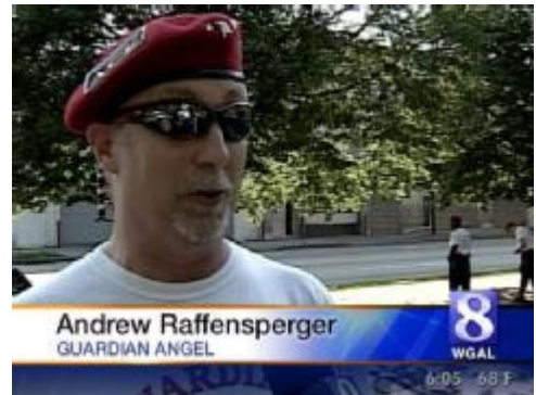
York's Guardian Angels made a stop to patrol part of Allison Hill.

The shooting marked the 11th of the month in Harrisburg (see interactive map below).